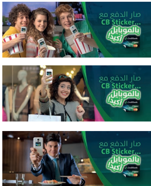
fb cover ads